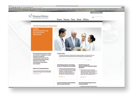
Online HCPCS C-Code Finder