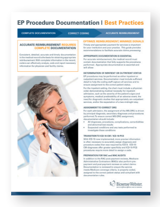
EP Procedure Documentation Best Practices