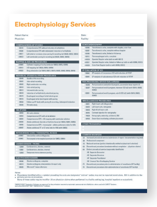
Electrophysiology Coding Checklist