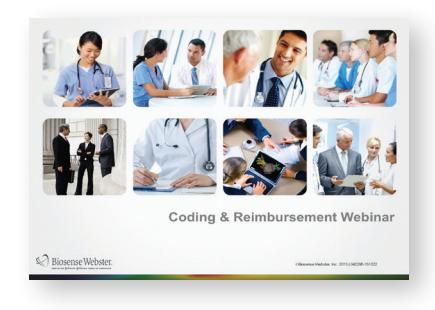
Coding & Reimbursement Webinars